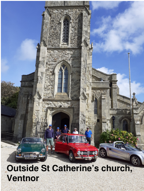
Outside St Catherine's church, Ventnor